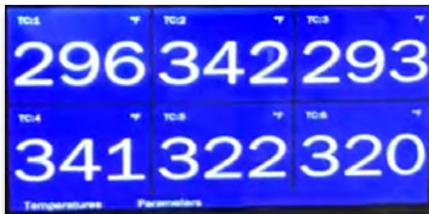
Temperature Screen BEFORE

The beta screen proved hard to use due to harsh color contrast and the inability to discern where one number ended and another began. Each panel was also indistinguishable in terms of function.