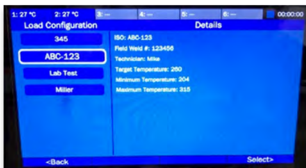
Original Load Configuration Screen BEFORE

Beta customers complained that the screen was very difficult to read in high-light outdoor environments.