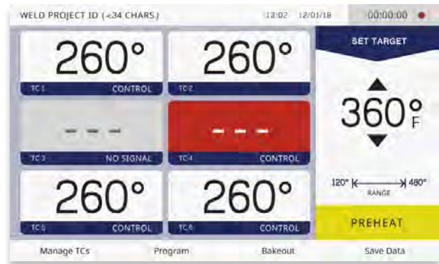
Temperature Screen AFTER

We designed a simple, clean, consistent look and feel, including a color palette, icons, and font styles. All elements are compliant with best practices for visual usability and accessibility standards. The client can use our code to build future enhancements.